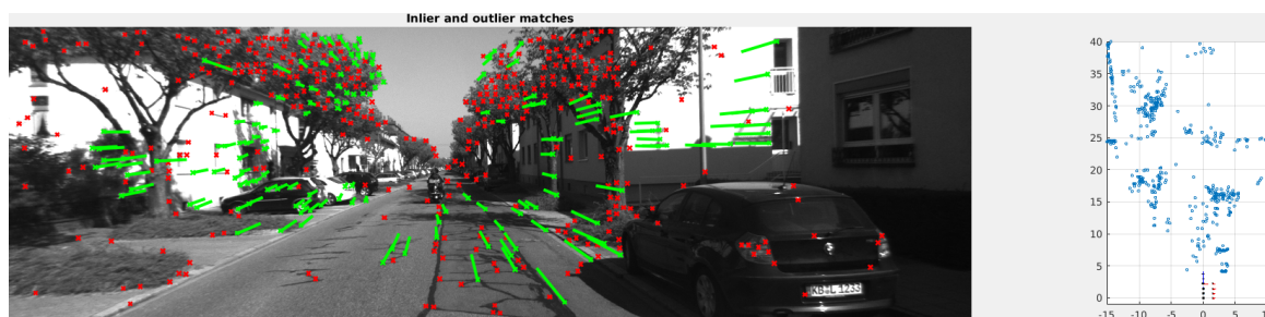
Figure 1: Outlier rejection and localization using PNP and RANSAC. Left: Inliers with displacement (green) and outliers (red). Right: 3D points (blue) and recovered camera poses.

previous exercises - you may use your own code, but it's probably less hassle if you use the reference implementations.