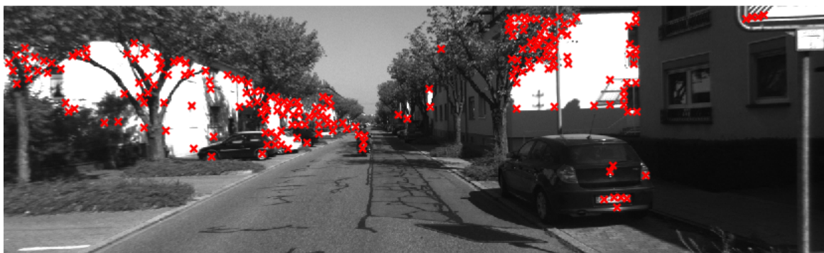
Figure 3: Keypoints selected in the first frame of the KITTI dataset.

Your entire function should contain only one for-loop - to iterate over single keypoint selection. Take a closer look at the ways in which the max function can be used. ind2sub might also be helpful. Fig. (3) shows what you should roughly get.