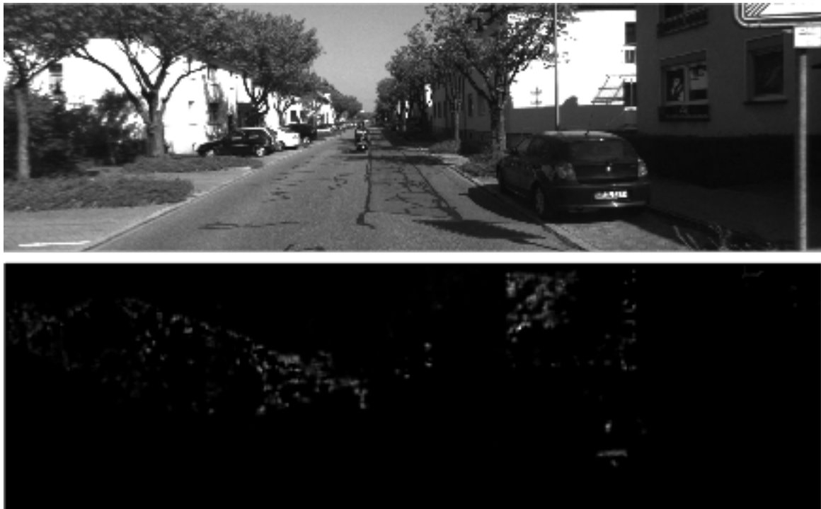
Figure 2: Harris scores for the first frame of the KITTI dataset.