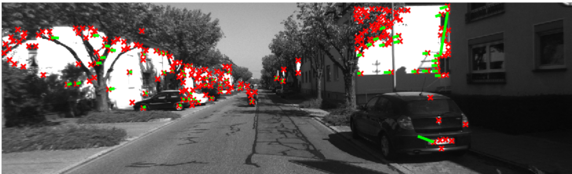
Figure 1: Matching features from the first two frames in the KITTI dataset.

In this exercise, you will implement a simple keypoint tracker from scratch, using only the knowledge you have so far obtained in the class. You will run this keypoint tracker on the first 200 frames of the popular KITTI dataset.